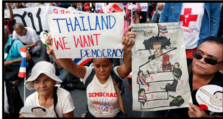
A demonstration in support of democracy in Thailand.

In Thailand's parliament, there is a total of 750 seats. Thailand's electorates vote for the 500 seats in the lower house, 250 seats of the upper house are voted on by the military, and combined votes from both houses select the Prime Minister. This election was to determine whether Thailand would become a democracy or stay under military control. Thailand is politically split among the poorer and rural areas, the urban upper class and elites, and the military supporters. If the results of the election go well for the Military, current Prime Minister Prayuth Chan-o-cha will stay in control and will be backed with a political majority. If the results do not go well for the military, Chan-o-cha will be left with his political party as the minority and will face political gridlock.