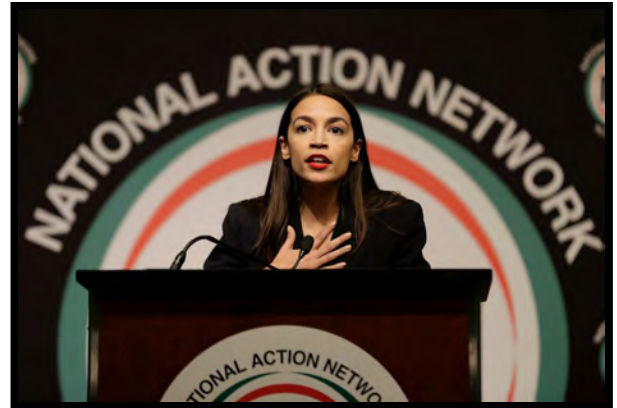
Rep. Alexandria Ocasio-Cortez (D-NY), who cosponsored the resolution with Sen. Ed Markey (D-Mass.)

In a vote that many Democrats decried as a “sham,” the non-binding resolution known as the “Green New Deal” failed by a 57-0 margin in the Senate on March 26, 2019. The resolution, jointly proposed by Rep. Alexandria Ocasio-Cortez (D-NY) and Senator Ed Markey (D-Mass.) on February 7, introduced an ambitious plan to transition completely to renewable energy by the year 2030 to combat climate change. All but three Democrats—Kyrsten Sinema (Arizona), Joe Manchin (West Virginia) and Doug Jones (Alabama)—joined with Republican Senator Susan Collins (Maine) in voting “present” on the measure. By voting “present,” Democrats protested what they believed to be a rushed and unnecessary vote forced by Senate Majority Leader Mitch McConnell. The 1985-word resolution establishes that climate change is an immediate threat to the economy of the United States and the health and well-being of