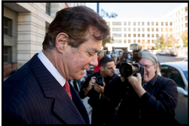
Paul Manafort, an American lobbyist, political consultant, and former campaign manager of President Donald Trump.