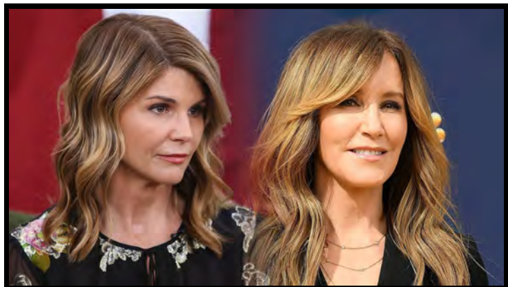
Lori Loughlin and Felicity Huffman indicted in college admissions scam.

The cheating was carried out in a myriad of ways. First of all, many parents paid thousands of dollars for high scores on standardized tests, extra time given to children who were not in need, and having someone else take the test or correct for one of the students in question. Many of the children in question insist they did not know this had taken place at the time. (continued on pg. 2)