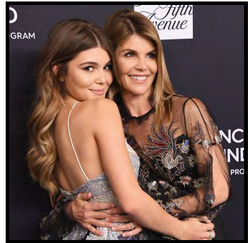
Lori Loughlin's daughter, Olivia Jade, a popular youtuber and former student at USC.