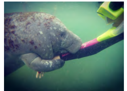
TEACHER MELODY SWIMMING WITH MANATEES IN FLORIDA!