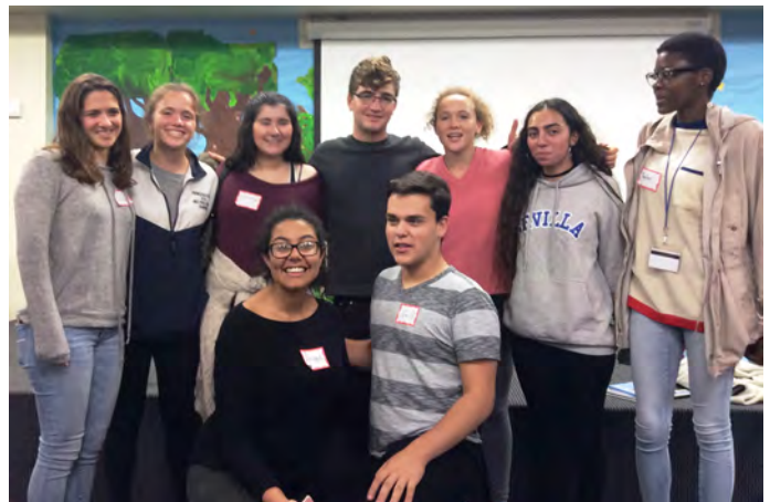
Seniors from the Upper School helped us cook and then read the story Stone Soup to us.